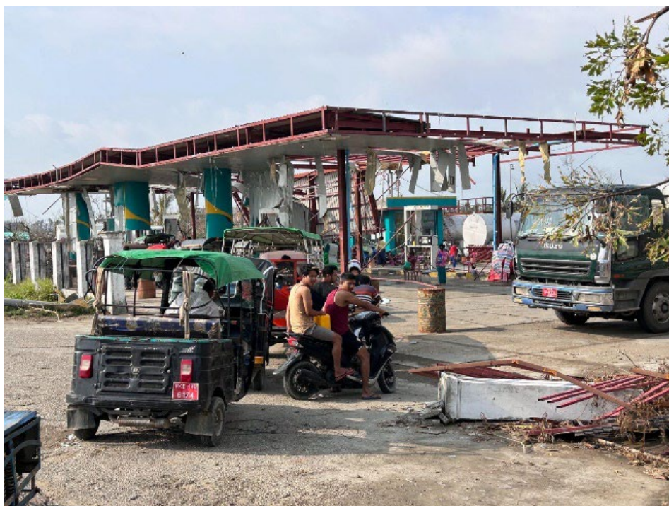
Vehicles and tuk-tuks queuing in a Cyclone-affected gas station in Sittwe. Rakhine.

Concerns persist in flooded areas regarding the spread of waterborne disease and the movement of landmines in conflict areas. Humanitarian partners have preemptively developed awareness-raising messages in local languages around these concerns. These messages are being disseminated among affected communities in these areas to raise awareness and promote safety precautions.