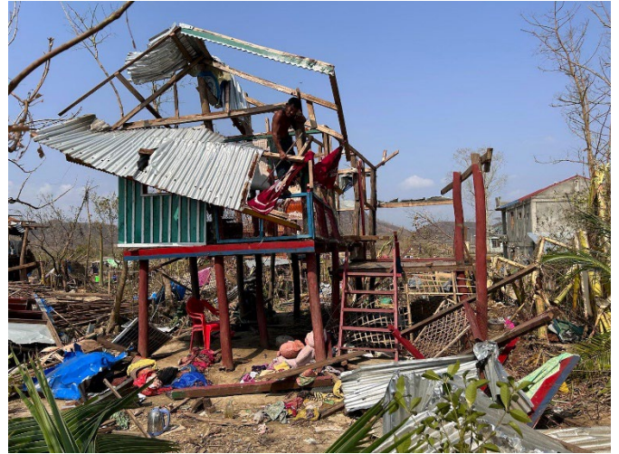
A man repairing his Cyclone-affected house in Ku Taung village, Rathedaung, Rakhine.