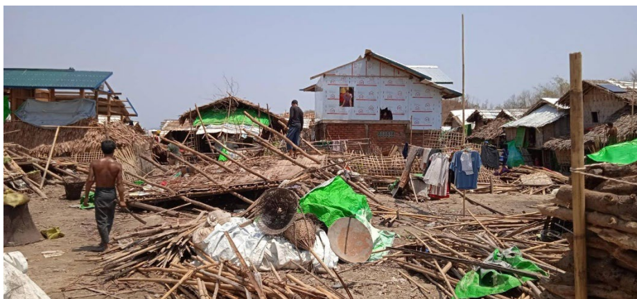
Destruction in Ah Htet Myat Lay IDP camp after cyclone Mocha. Ponnagyun, Rakhine.