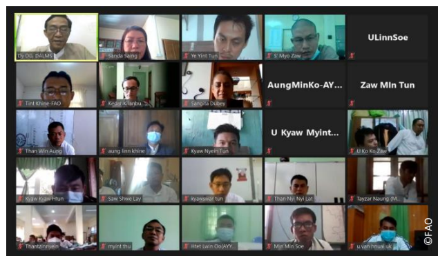
Participants joined CAPI training via zoom

In support of the 2020 round of the World Programme for the Census of Agriculture (WCA), the FAO Regional Office for Asia and the Pacific (FAORAP) extends its technical assistance to countries in the region for adoption and implementation of cost-effective technologies such as Computer Assisted Personal Interview (CAPI) in Agricultural Censuses and surveys.