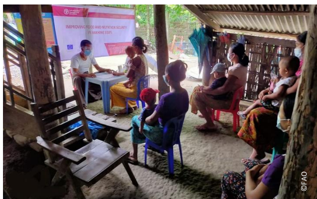
Cash and hygiene items distribution in Rakhine State

In August 2020, a new surge in locally transmitted cases of the coronavirus disease 2019 (COVID-19) was reported in Rakhine State and other regions of Myanmar. According to the Ministry of Health and Sports, as of 30 October, 50 403 confirmed cases have been reported in Myanmar, with 2 858 confirmed cases in Rakhine State.