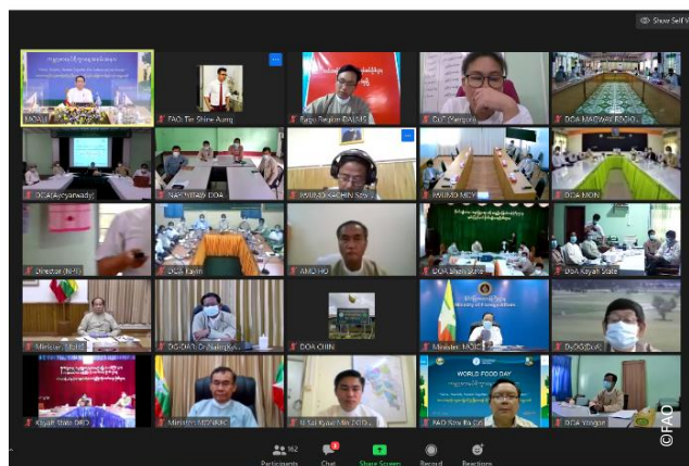
Participants at virtual commemoration of World Food Day

"The world is looking to us to put our actions where our words are – to be think-tank and action-tank rolled into one. Alongside our partners, we must be knowledge-generators and -facilitators all at once, together in the quest for the ultimate public good: a world free of poverty, hunger and malnutrition" he added.