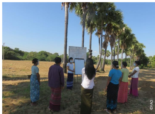
Soil management training for farmers in Nyaung U township

The FAO SLM-GEF Project has been promoting various relevant climate smart agriculture (CSA) techniques mainly using Farmer Field School (FFS) model which also includes various techniques on sustainable soil management such as crop diversification, inclusion of leguminous crops in the cropping system, mulching, agroforestry, conservation agriculture, use of organic fertilizers, composting, vermiculture etc. Promotion of those CSA practices have genuinely contributed to improving soil structure and enriching soil fertility.