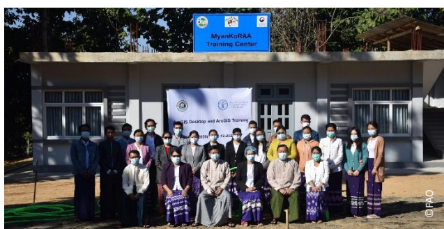
Training participants and officials from FAO and MoALI