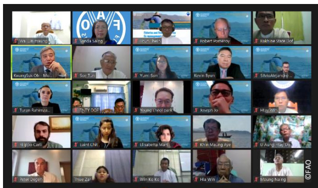
Participants at Fisheries Co-management virtual event