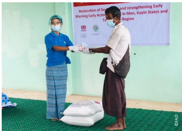
Provision of agriculture inputs in Tanintharyi Region

The support provided to vulnerable farming families in October 2020 consists of the following: