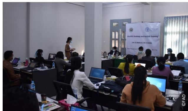
ArcGIS demonstration by the technical consultant

In collaboration with the Ministry of Agriculture, Livestock, and Irrigation (MoALI), the FAO in Myanmar has started the implementation of TCP project “Technical Assistance in Development of Strategic Tools for Planning Agriculture Diversification and Dietary Improvement” in October 2018.