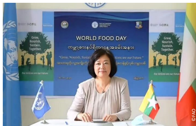
FAO Representative addressing participants at WFD virtual event

The Food and Agriculture Organization of the United Nations (FAO) celebrated World Food Day and 75 years of working to achieve a world without hunger, malnutrition, and poverty. As part of the celebrations, FAO Myanmar in collaboration with the Ministry of Agriculture, Livestock and Irrigation (MoALI) held a virtual event with the theme “Grow, Nourish, Sustain. Together. Our Actions are our Future”.