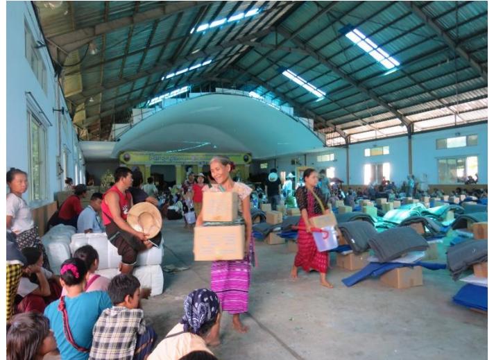
Core relief items (CRIs) distribution in Hlaingbwe Township, Kayin State