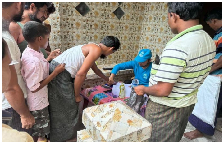
Tarpaulin and rope distribution in Sittwe Township