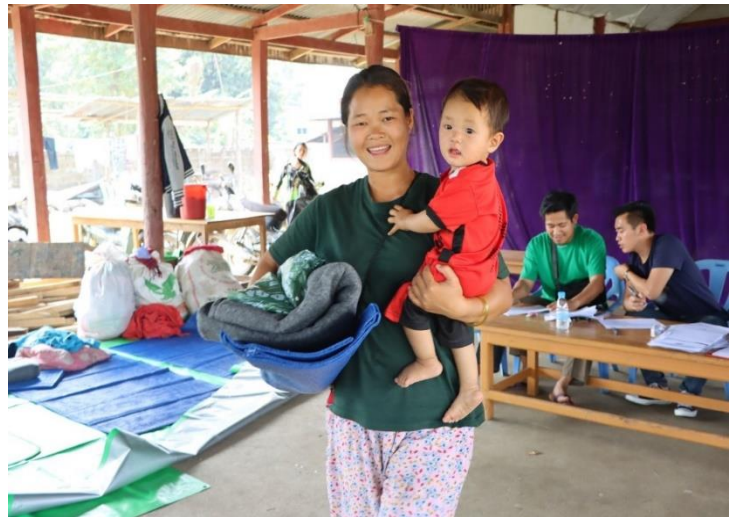
CRIs distribution to IDPs in a collective centre in Waingmaw Township, Kachin State