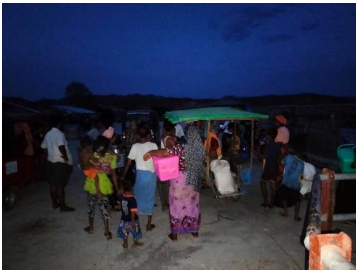
Rohingya people from Taung Paw moving to an evacuation site ahead of cyclone Mocha. Myebon township, Rakhine.