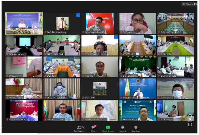
Participants at virtual commemoration of World Food Day

"The world is looking to us to put our actions where our words are – to be think-tank and action-tank rolled into one. Alongside our partners, we must be knowledge-generators and -facilitators all at once, together in the quest for the ultimate public good: a world free of poverty, hunger and malnutrition" he added.