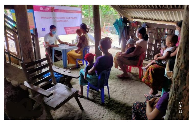
Cash and hygiene items distribution in Rakhine State

In August 2020, a new surge in locally transmitted cases of the coronavirus disease 2019 (COVID-19) was reported in Rakhine State and other regions of Myanmar. According to the Ministry of Health and Sports, as of 30 October, 50 403 confirmed cases have been reported in Myanmar, with 2 858 confirmed cases in Rakhine State.