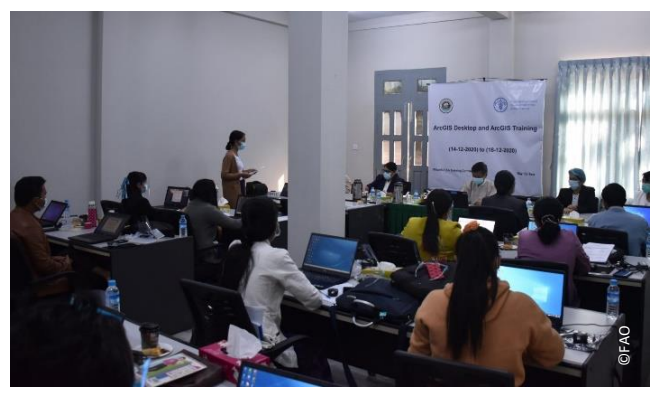
ArcGIS demonstration by the technical consultant

In collaboration with the Ministry of Agriculture, Livestock, and Irrigation (MoALI), the FAO in Myanmar has started the implementation of TCP project "Technical Assistance in Development of Strategic Tools for Planning Agriculture Diversification and Dietary Improvement" in October 2018.