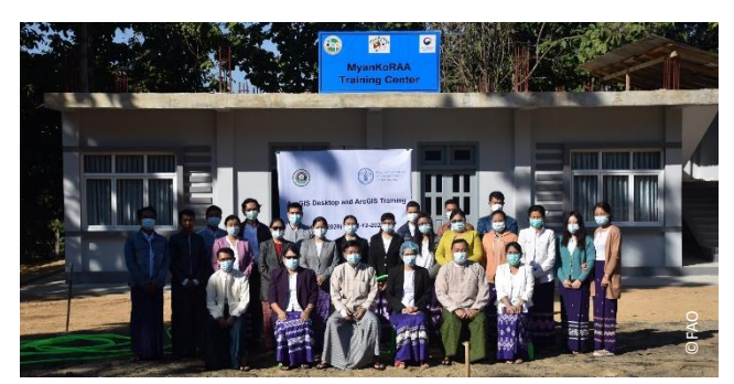
Training participants and officials from FAO and MoALI

The training with support of service provider, ESRI, provided in hybrid arrangement in line COVID-19 control measures.