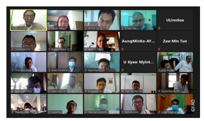
Participants joined CAPI training via zoom

In support of the 2020 round of the World Programme for the Census of Agriculture (WCA), the FAO Regional Office for Asia and the Pacific (FAORAP) extends its technical assistance to countries in the region for adoption and implementation of cost-effective technologies such as Computer Assisted Personal Interview (CAPI) in Agricultural Censuses and surveys.