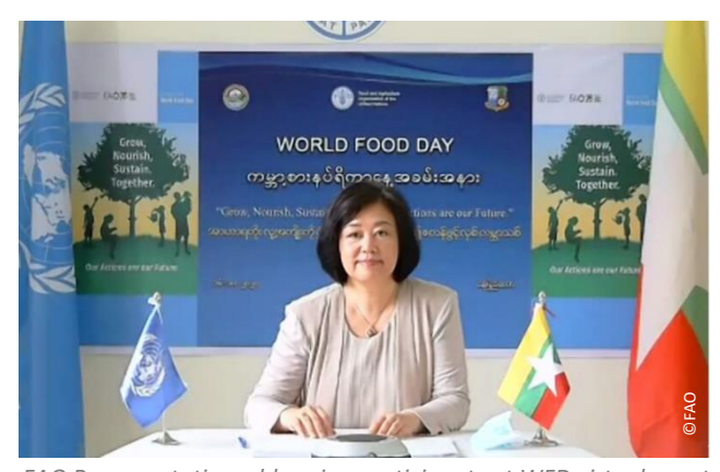
FAO Representative addressing participants at WFD virtual event

The Food and Agriculture Organization of the United Nations (FAO) celebrated World Food Day and 75 years of working to achieve a world without hunger, malnutrition, and poverty. As part of the celebrations, FAO Myanmar in collaboration with the Ministry of Agriculture, Livestock and Irrigation (MoALI) held a virtual event with the theme "Grow, Nourish, Sustain. Together. Our Actions are our Future".