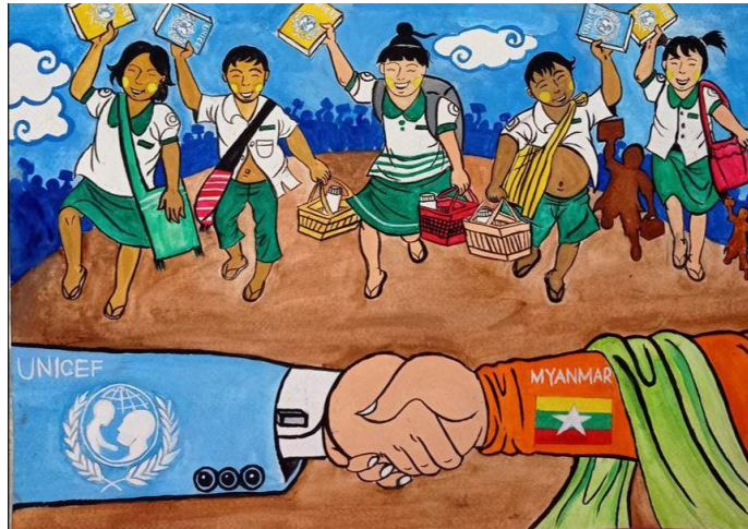
DETAIL (ABOVE) FROM ONE OF THE ENTRIES TO UNICEF WORLD CHILDREN'S DAY ILLUSTRATION COMPETITION

At the same time, UNICEF convened a workshop involving a diverse group of almost 40 young people, focusing on the theme of child-friendly cities . Participants, including people living with disabilities, representatives from different ethnic groups and varied socio-economic backgrounds, used a human-centered design approach to identify issues of concern including housing, sanitation, availability of public spaces and transportation, and they workshopped innovative solutions and recommendations to drive progress in these areas in Yangon.