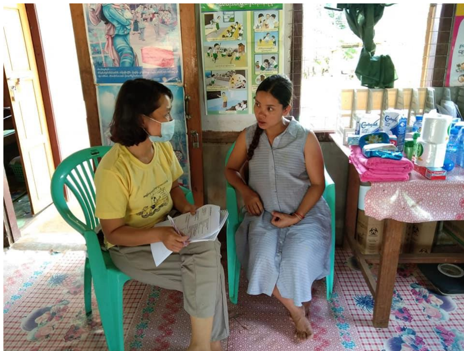
IOM PARTNER PDN INTERVIEWS A RETURNING MIGRANT