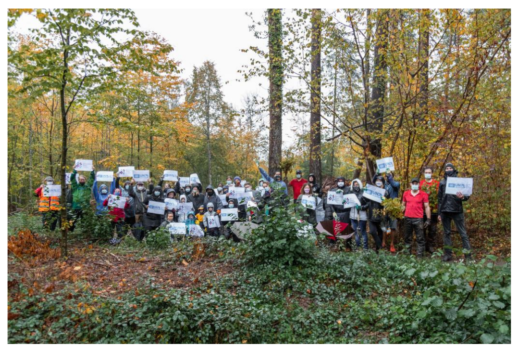
Happy #UN75! The International Trade Centre has planted 75+ trees to celebrate the United Nations' Anniversary and green growth!

The International Trade Centre has been supporting trade development and diversification in Myanmar to benefit small businesses. ITC is committed to continue contributing to the UN efforts in the country, including for post-COVID economic recovery.