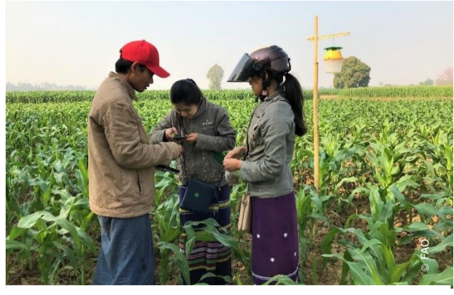
FAMEWS data collection using Pheromones traps and mobile

The Thirty-fifth Session of the FAO Regional Conference for Asia and the Pacific (APRC 35) held in a virtual format, from 1 to 4 September 2020, provided a forum for delegates to discuss current country and regional priorities and pressing issues in the region such as the impact of COVID-19, the state of agriculture, natural resources management and food security and nutrition. It was also an opportunity for the Food and Agriculture Organization of the United Nations (FAO) to highlight examples of partnerships, innovation, and digital technologies that are helping to improve food security and nutrition across the region and regional and global policy and regulatory matters. Held in a virtual format, 40 member countries of the FAO participated in this year's four-day regional conference.