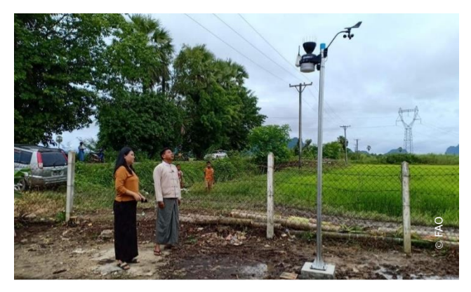
Weather sensor provided in Hpa-an township, Kayin State

The training sessions focused on the use and maintenance of weather sensors to monitor forecasts. The technical staff had the opportunity to review key aspects of data collection, weather data interpretation, and other relevant information that farmers can benefit from to improve their productivity. This training is in line with one of three priority areas of FAO's in Myanmar, which is to enhance the resilience of local communities and farming households to natural disasters.