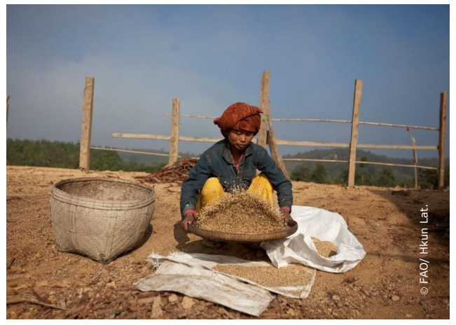
Rural family farmer from Sagaing Region

There is a common ground to face all these challenges: agriculture. Agriculture and food systems, which represent how our food is produced and consumed, could be transformed to work for nutrition, health and the environment, but also for job creation, economic growth, stability and welfare. To make it happen, it is more important than ever to create a policy and institutional environment that attracts both public and private investments.