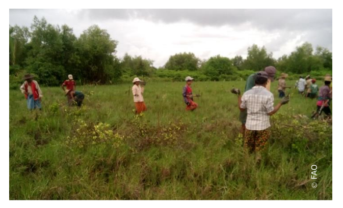
Mangrove restoration in Ayeyarwady Region

The mangroves provide feeding, breeding and nursing grounds for numerous fish, and the majority of the community earns a living from fishing in the region.