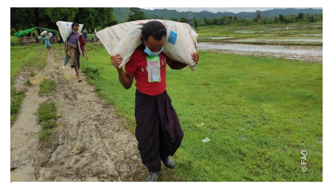
Fertilizer distribution in Maungdaw Township

According to a United Nations policy brief on the impact of COVID-19 on Southeast Asia, the pandemic has inflicted real suffering, with a disproportionate impact on the most vulnerable. The brief also highlighted prevailing inequalities, concerns over governance, and the unsustainability of the current develop-ment pathway.