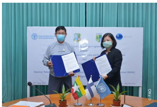
Launching of National Forest Inventory Project in Myanmar

The five-year project will be implemented by FAO Myanmar in collaboration with the Ministry of Natural Resources and Environmental Conservation, thanks to a EUR 8 million endowment from the Government of Finland, a consistent partner in the promotion of environmental sustainability.