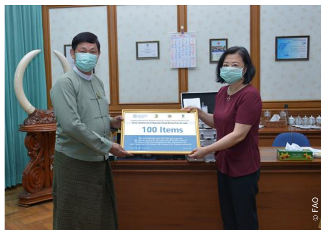
Handover of teaching aids to Myanmar Forest School