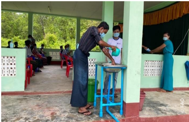
Hygiene sensitization in Maungdaw Township, Rakhine State

and individual actions to protect oneself and others from getting sick.