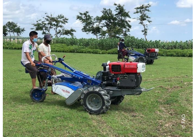
Mechanizing training in Buthidaung Township, Rakhine state

Green Earth, conducted training for over 30 farmers on basic skills related to managing, maintaining, and repairing mechanized power tillers. A total of 19 machines were provided for use in 15 villages to help farmers prepare their land for the monsoon-planting season.