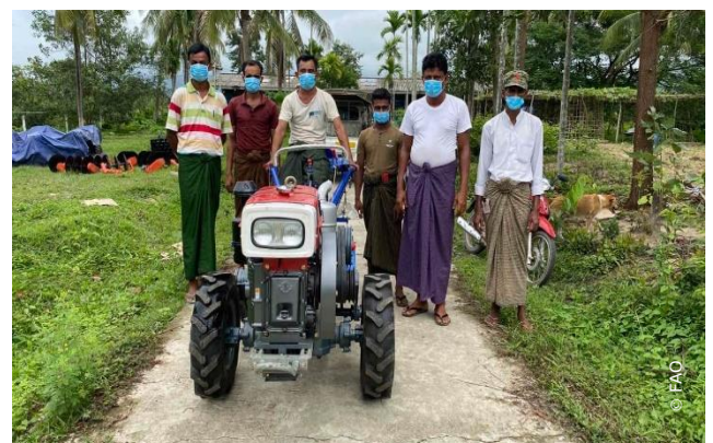
Agriculture mechanization, Maungdaw Township, Rakhine State

The recently launched government's COVID-19 Economic Relief Plan (CERP) outlines support for farmers and agricultural businesses through proposed actions that let development partners and other actors know that the government recognizes the importance of food and nutrition security, as well as increased production in the agriculture, fishery, and livestock sectors.