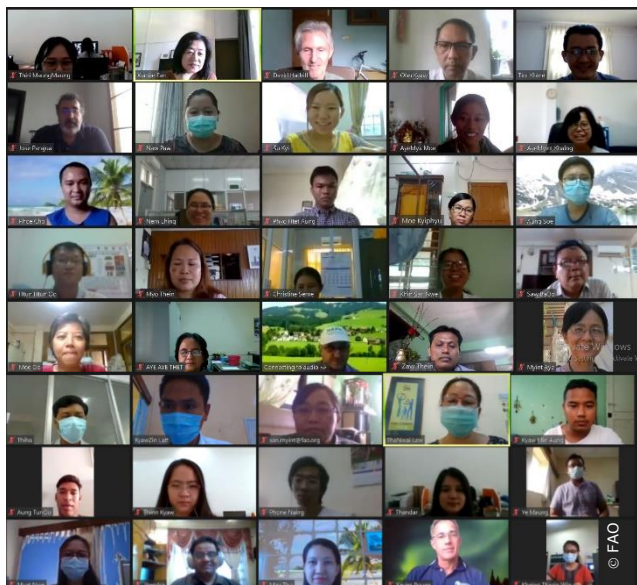
Participants attended the virtual trainings