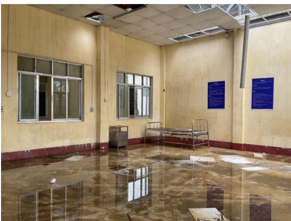
Thet Kae Pyin Station Hospital is out of action following damage from Cyclone Mocha. Sittwe. Rakhine.