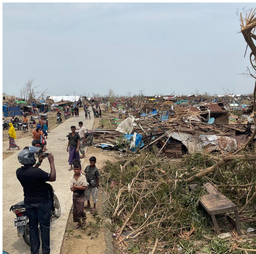
Families assess the damage at Ohn Taw Gyi North IDP camp. Sittwe, Rakhine.

There are local reports of possible deaths and of people being missing, including IDPs. The UN and its partners are working to start rapid needs assessments as soon as access is granted to better understand the impact of the disaster. Negotiations for access are ongoing.