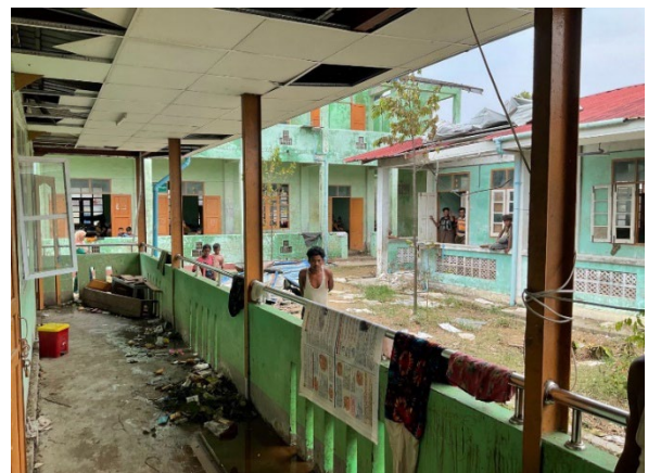
Thet Kae Pyin High School was used as shelter for 200-300 people. Sittwe, Rakhine.