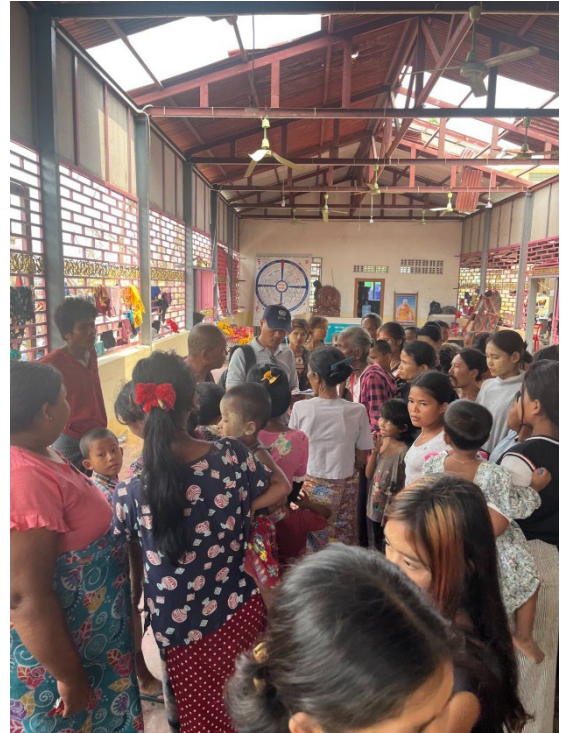
People sheltering in a monastery in Sittwe town. Sittwe, Rakhine.

Information in this update is based on inputs from humanitarian partners and local sources.