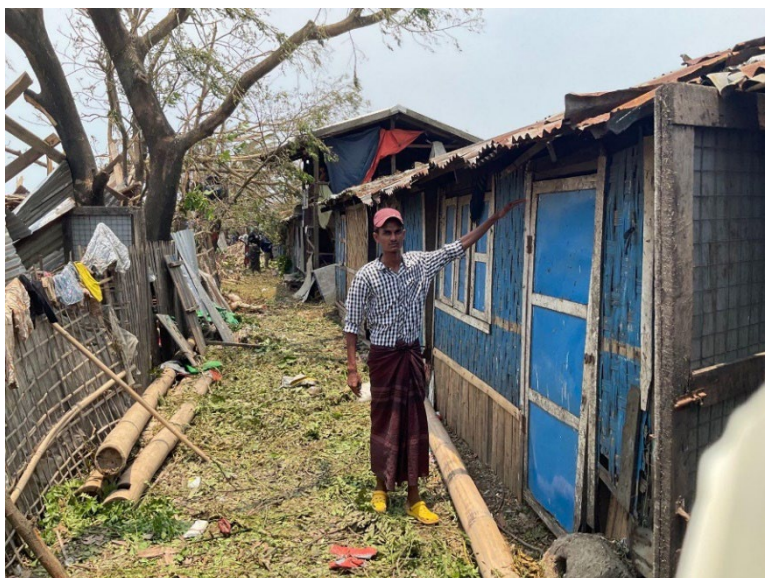
A man shows the water level during the storm surge in Ohn Taw Chay, Sittwe, Rakhine.

The local authorities have reportedly started to deploy their staff since 15 May to assess the ground situation and collect information. They will reportedly initiate township-level coordination meetings, calling upon all organizations to contribute ground-level information and request emergency response support.