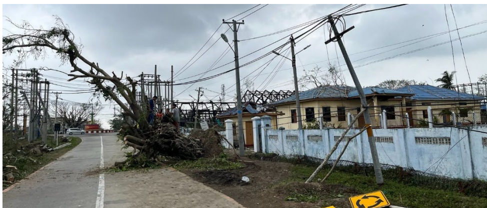
Uprooted tree on the street after Cyclone Mocha. Sittwe, Rakhine.