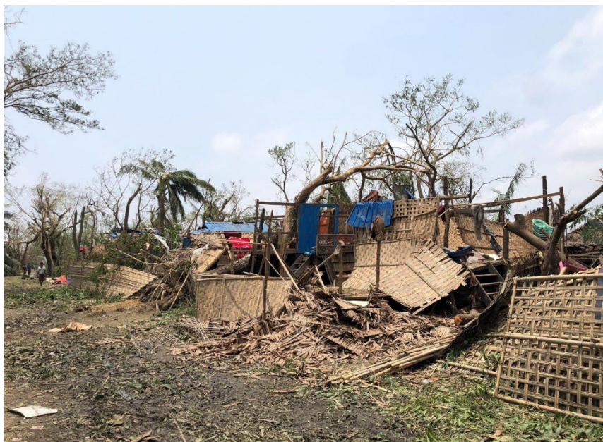
Damaged shelters in Thae Chaung camp. Sittwe, Rakhine.

Humanitarian partners have spent the day trying to confirm all staff are safe and get offices back up and running. UN buildings, including warehouses, have also suffered damage. OCHA continues to gather information and convened coordination meetings at the sub-national and national level today to kick-start the response to all communities. OCHA and its humanitarian partners are working to prepare for rapid needs assessments (RNAs) which it is hoped can begin on 16 May to confirm the impact of the cyclone and people's needs. Access requests for assessments have been pre-submitted and hundreds of trained partners are standing by, ready to deploy across the affected areas once given access. While travel authorizations (TAs) are still needed and advocacy continues for flexibility around the related requirements, as well as urgent customs clearances for supplies.