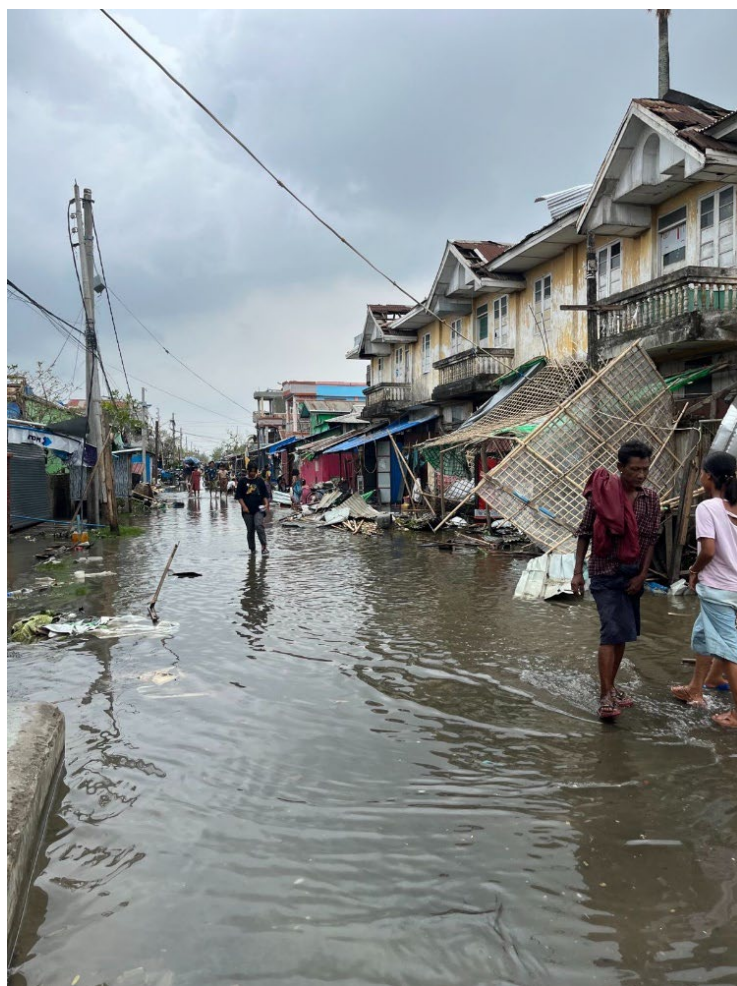
Flooded street after Cyclone Mocha. Sittwe, Rakhine.