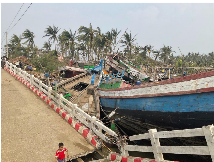
A bridge to Thae Chaung IDP camp that was destroyed by Cyclone Mocha. Sittwe, Rakhine.

• Movement is challenging and debris clearance is ongoing. Heavy traffic was reported during the day due to large numbers of people returning to their Sittwe homes from inland areas, combined with debris on the roads. Local fire brigades and charity groups/volunteers were seen clearing streets in Maungdaw, Mrauk-U, and Sittwe townships.