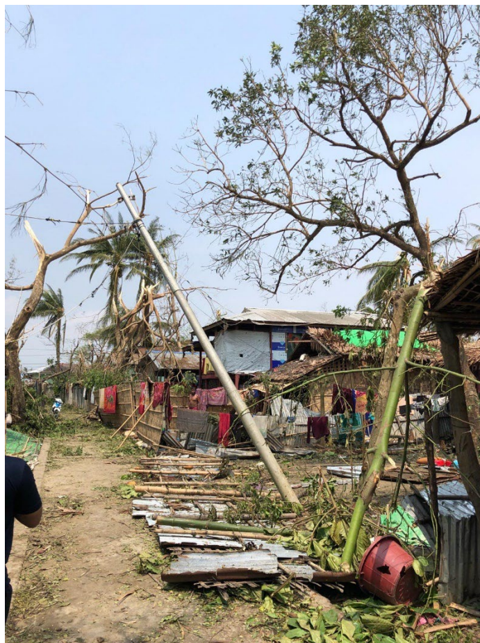
Damaged shelters in Dar Pai IDP camp. Sittwe, Rakhine.