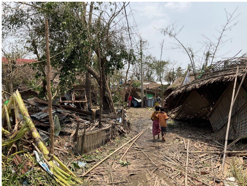
Two children walk through damaged Thae Chaung Camp. Sittwe, Rakhine.

The Extremely Severe Cyclone Mocha crossed the coast between Cox's Bazar in Bangladesh and Kyaukpyu township, near Rakhine's capital of Sittwe in Myanmar at lunchtime on 14 May. Winds were estimated as high as 250 kmph. Communications with teams on the ground are still limited but early reports suggest the damage is significant, particularly in Rakhine, and that needs across all communities will be high. Extremely strong winds brought down power lines, uprooted trees, and damaged and destroyed houses. Storm surge knocked out bridges and inundated homes. In Sittwe, most housing is thought to have been damaged in some way and many flimsy long houses in IDP camps have been destroyed.